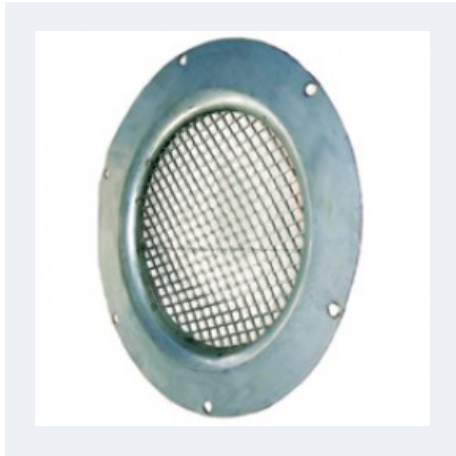
INLET STAINLESS STEEL GUARD

Inlet protection guard manufactured in stainless steel AISI 304. Avoid entrance of objects inside the fan in order not to be in contact with the turbine.